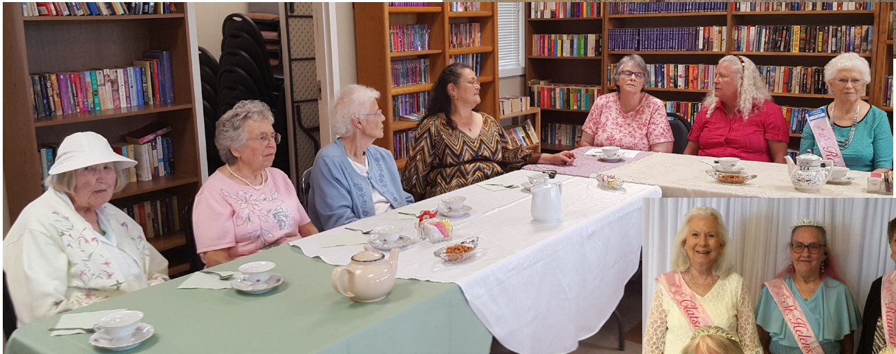
Columbia County Princess Tea attendees