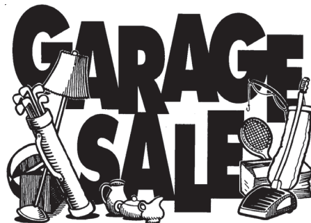
TABLE RENTAL $10

Have you noticed the table-top refrigeration unit nestled next to the coffee dispenser? Due to a generous donation, we are so pleased to now be able to offer many refrigerated food items for your convenience and carry-out. Foods will change as new foods are available. Be sure to check before leaving and see if there is something you might like to use for a lunch, dinner or a snack later on. A food-donation jar is next to the refrigerator.