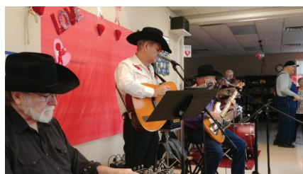
The Boursaw Brothers