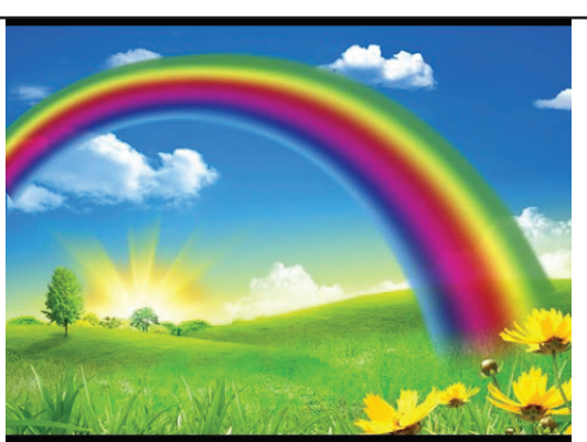
Come on Down! GOOD NEWS

48 W 7th Street, Rainier, OR 97048 E-mail: RainierSeniorC@gmail.com