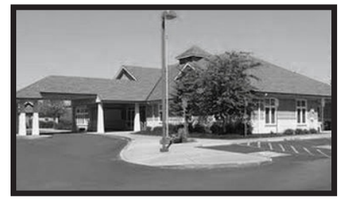
"A Great Place...For Great People"

Cap "N' Yoby City of Rainier Columbia Food Bank Deer Island Grange Delaware Plaza Eagles Foster Farms Fred Meyer Guadalajara InRoads Miracle Ear Monarca mexican Nvs Tree Farm Napa Auto Rainier Hstorical Museum Rainier Liquor Store Rainier Subway The Dog Zone United Way US Gypsum Vernie's Pizza