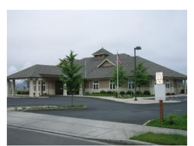
"A Great Place...For Great People!"

Rainier Senior Center 48 West 7<sup>th</sup> Street Rainier, OR 97048